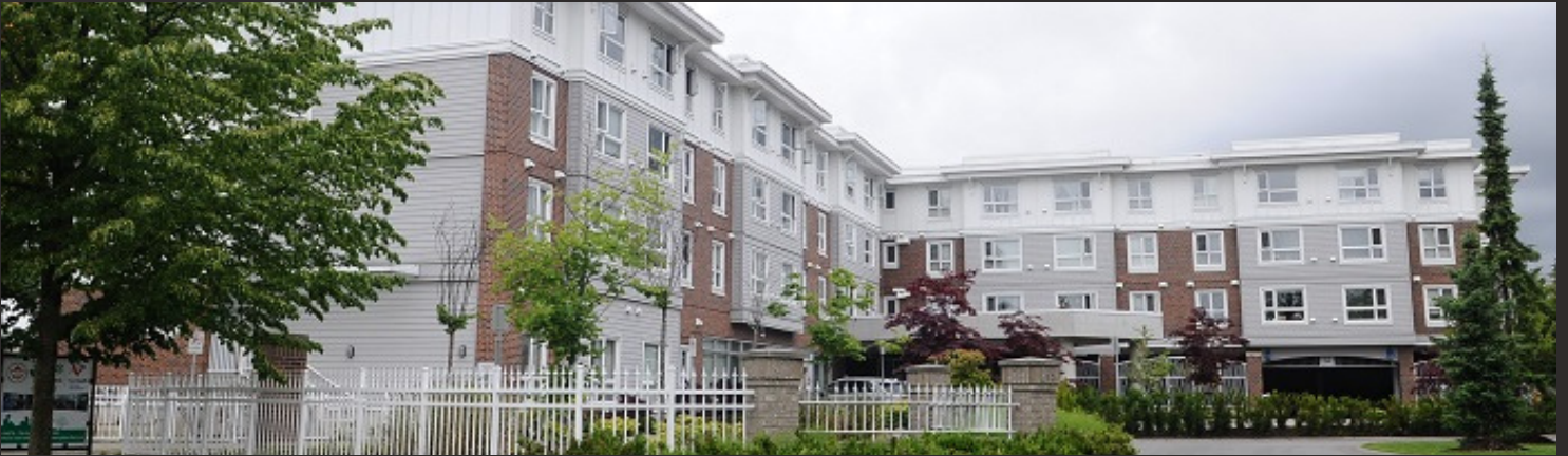
PICS SENIOR LIVING 54 units - (Blinds + Installation)