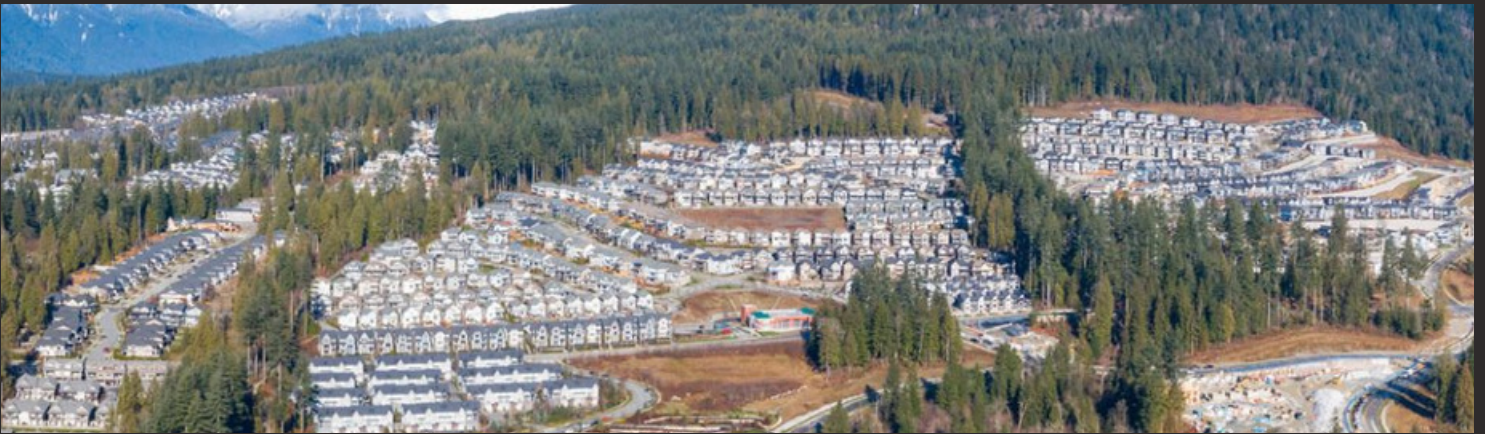
NOURA BURKE MOUNTAIN HOMES 50+ 3 story homes (Blinds + Installation)