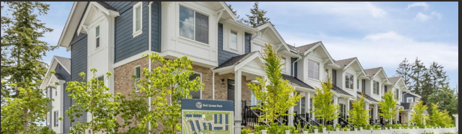
BELL GREEN PARK (Blinds + Installation 57 units and more)