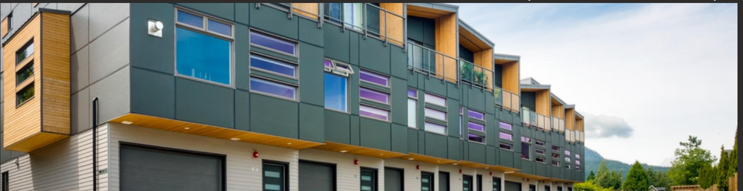
HALYARD GIBSONS 12 units - (Blinds + Installation)