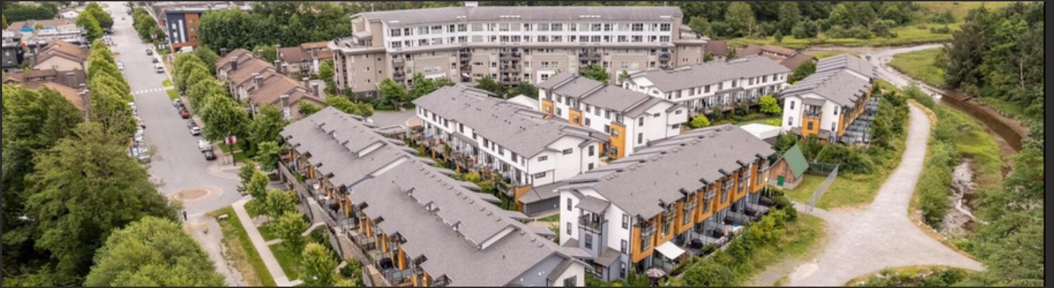
61 units - (Blinds + Installation) SOLIEL SQUAMISH ^