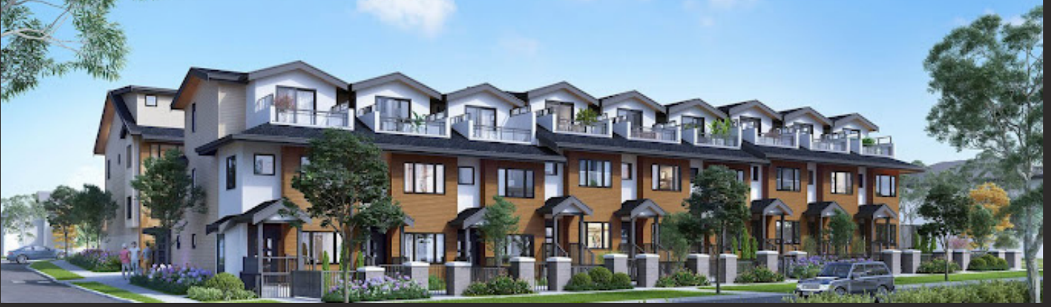
REA GARDEN 26 units - (Blinds + Installation)