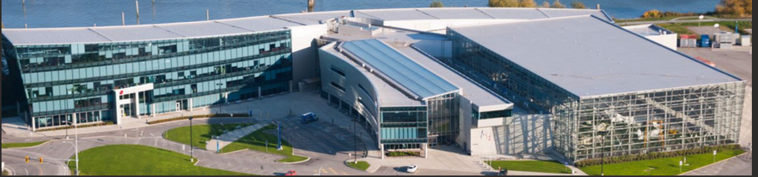
BCIT AEROSPACE CAMPUS ^ (installation)